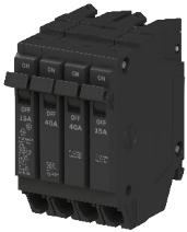
02 THQLQ Quads breaker