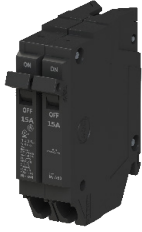
01 THQLT Tandem breaker