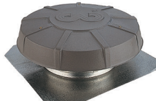
VX1000 Cicolac® Brown