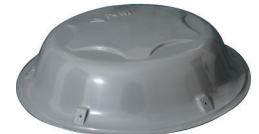
ABS Cicolac® Grey