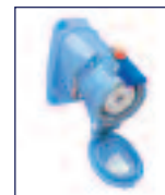
Female Receptacle with Angle Adapter 63-64043 + 61-6A027