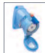
Female Receptacle with Angle Adapter 63-14043 + 61-1A027